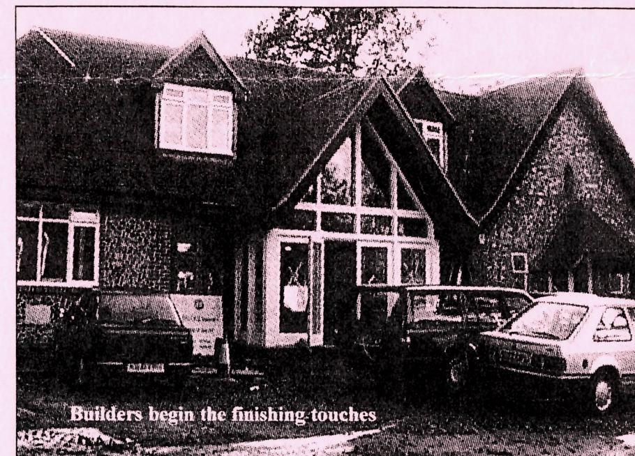
Builders begin the finishing touches

A rapid assembly stage system will provide flexible facilities for various occasions. A ground floor kitchen will enable users to serve hot or cold meals and beverages. A suite of rooms on the first floor can be reached by stone stairway or platform lift for the disabled.