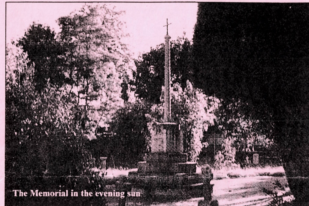
The Memorial in the evening sun

We are delighted to say that sufficient money has been raised for the renovation work to proceed.