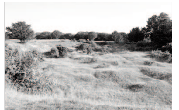
The 'chalk pit' on Merrow Downs

'chalk pit' is one of these areas with 14 plants on the Surrey Rare Plant Register including Frog Orchid, Juniper, Round-headed Rampion, Autumn Gentian, Bastard Toadflax, Common Rock-rose and Carline Thistle, all vulnerable to those who are unaware they are there. Here is an isolated colony of Chalk Hill Blue butterflies and a few females are still laying on the leaves of Horseshoe Vetch. During the lockdowns there was increased usage of Merrow Downs and people were seen