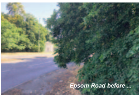
Epsom Road before ...

In June two of our volunteers removed a couple of tree roots from the upper part of the footpath