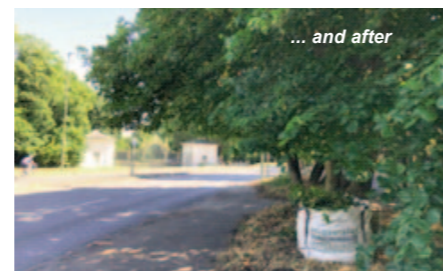
... and after

which runs from beside the cricket pavilion alongside Clandon golf course (near the large water tank). These tree roots had been trip hazards in the past, especially in autumn when they were hidden by leaves.